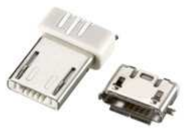
ESB22A (A Plug) + ESB227 (AB Socket)